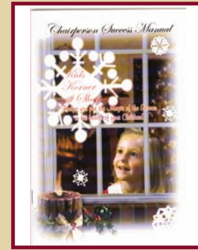
Chairperson Success Manual to help make the sale go smoother.