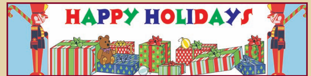
Decorative Table cloths