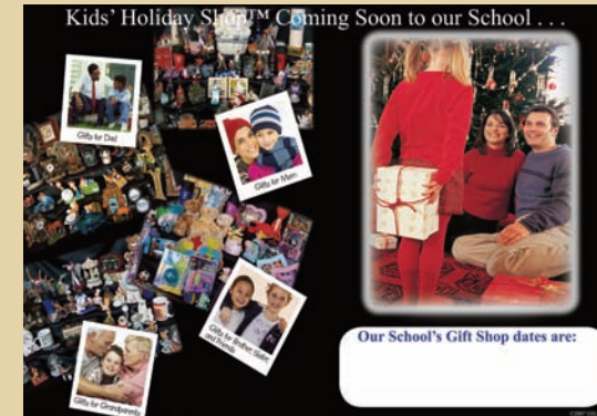
Full Color Posters to advertise your sale. Great to put up around the school.