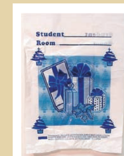
Plastic Shopping Bags for each student to carry their gifts home in.