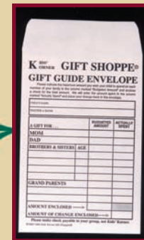
Gift Guide Envelopes for each student in the school. These envelopes are designed so that the parents can aid their children in budgeting how much to spend on each member of the family.