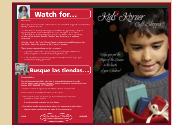
"Watch For Flyers" for each student in your school to be sent home in October to announce the upcoming Shoppe and help recruit volunteers. (Also Available in Bilingual)