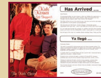
"Has Arrived Flyers" for each student in the school to take home the weekend before the Shoppe. (Also Available in Bilingual)