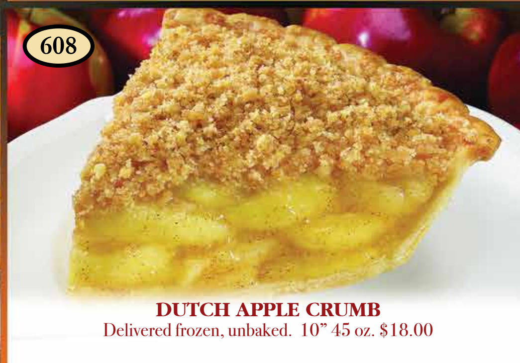
DUTCH APPLE CRUMB

Delivered frozen, unbaked. 10" 45 oz. $18.00