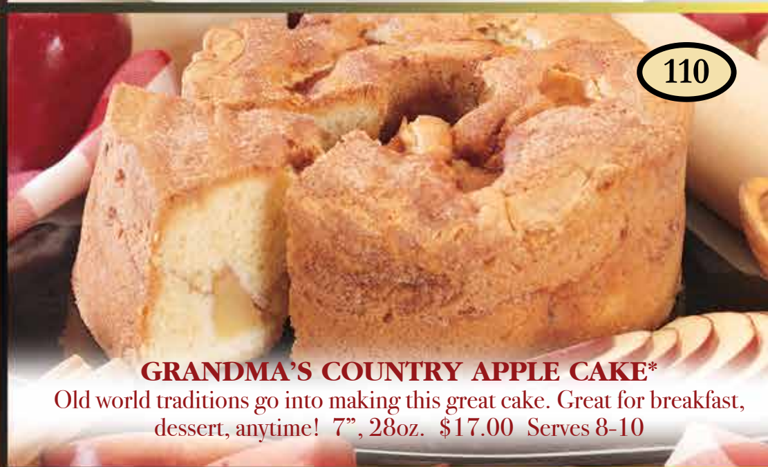
GRANDMA'S COUNTRY APPLE CAKE*

Old world traditions go into making this great cake. Great for breakfast, dessert, anytime! 7", 28oz. $17.00 Serves 8-10