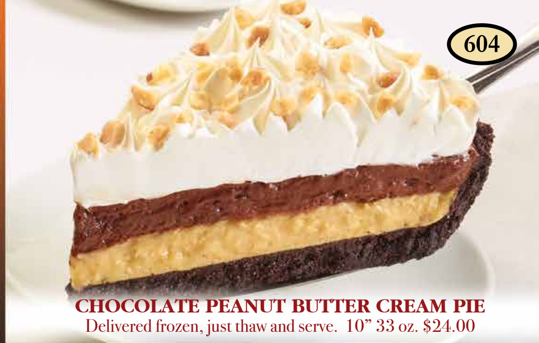
CHOCOLATE PEANUT BUTTER CREAM PIE

Delivered frozen, just thaw and serve. 10" 33 oz. $24.00